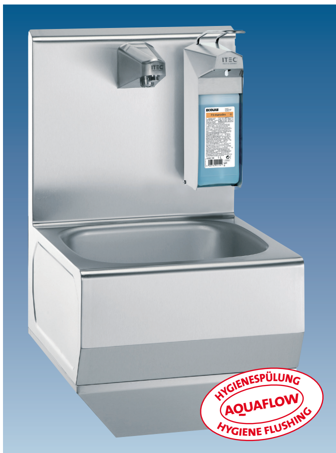
≡ Cleaning basin, type 20550