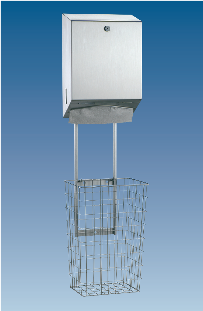
≡ Stainless steel folded paper towel dispenser